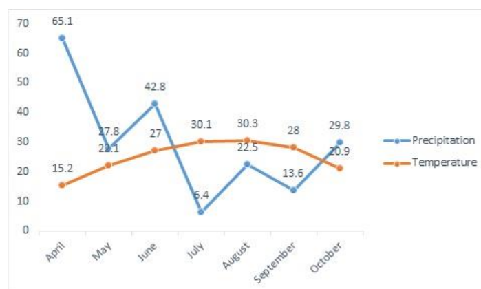
Figure 1. The pattern of temperature and precipitation change in 2016 cropping season in Gonbad Kavous, Iran.

In the drought-stress experiment, irrigation was discontinued from 40 days after transplanting (the stage with maximum tillering) to the end of the growth period. Samples were taken on 50, 60, 70, 80 and 90 days after planting in the drought stress condition and the soil water contents were estimated to be 0.32, 0.24, 0.18, 0.08 and 0.04 (kg/kg), equivalent to -0.05, -0.12, -0.27, -0.72 and -1.1 soil water potential (MPa).