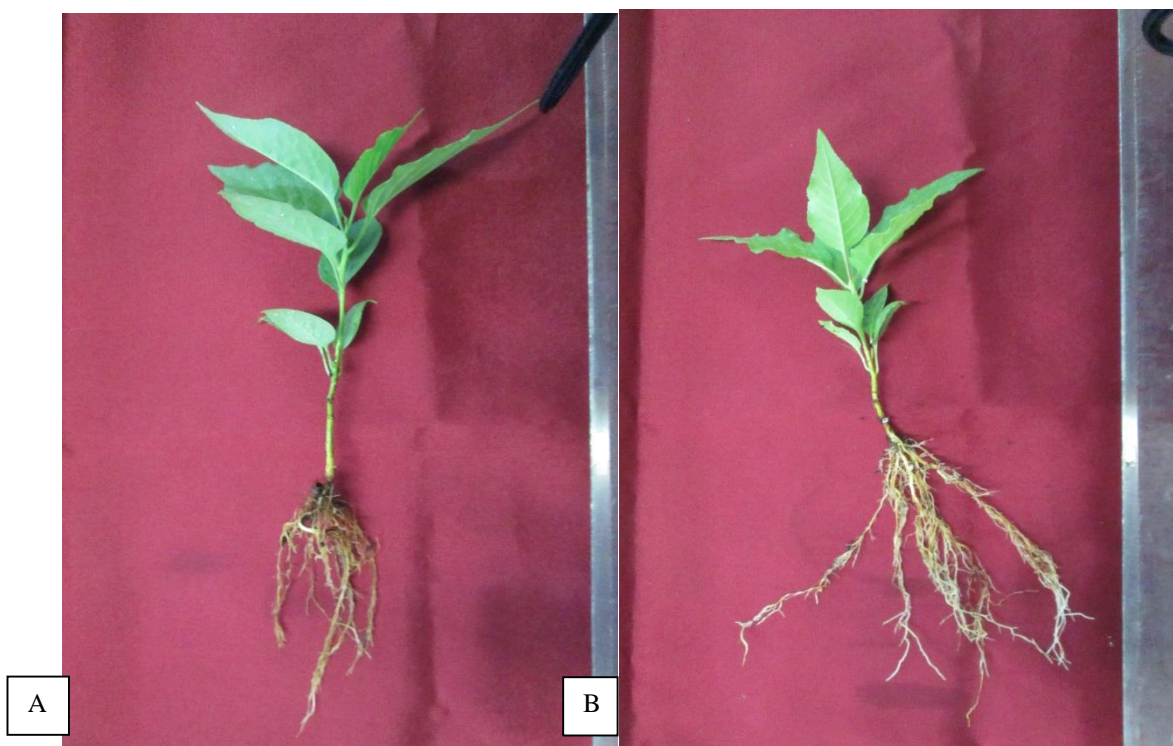
Figure 1. Effect of AMF inoculation on root length of in vitro raised PHL-C plantlets. A) Control B) Diversispora epigaea

poor cuticular development and will be dry because of excess transpiration and transition to new environmental conditions (Wang et al. 1993). It is necessary to pay special attention to environmental biofertilizers, in order to reduce the problems of dwarf seedling harvest and to reduce the losses during transmission of the ex vitro plantlets. In our study, the effects of all AMF were significantly superior over the non-mycorrhizal control with regard to physical, physiological and biochemical attributes. Among all mycorrhizal strains Diversispora epigaea was found superior suggesting its high suitability as biohardening agents for tissue culture raised PHL-C plantlets.