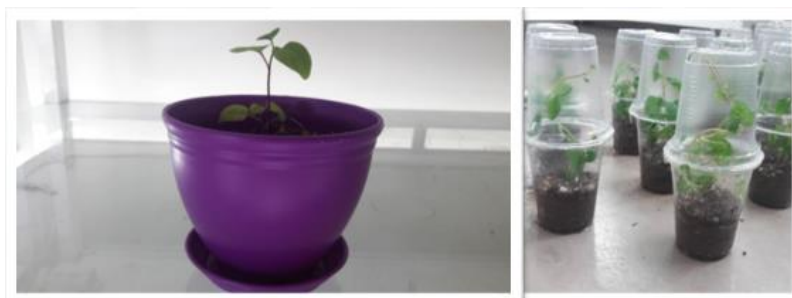
Figure 3. Hardening of the propagated shoots of Physalis alkekengi L. for transferring to the soil in the greenhouse.