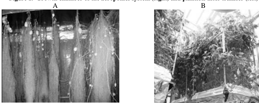
Figure 2. A: Growth and development of roots in the aeroponics system, B: Growth and development of stems in the aeroponics system

were measured. All tubers larger than 20 mm in size were removed at each harvest. Similar traits were measured in the conventional soil system in the greenhouse. Experiment was carried out as factorial based on completely randomized design layout with 10 replications. Potato cultivar (Agria, Marfona and Savalan) was regarded as the first factor and production system (AP, Aeroponics production system; SP, soil production system) as the second factor. The quality characters of the minitubers for both production systems (AP, SP), including minituber germination after the dormancy period, stem length and yield were measured.